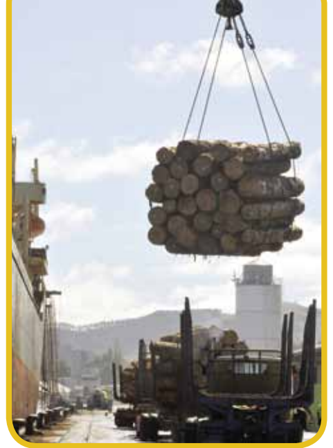
More logs head out over the wharves, making February an all-time record for Eastland Port.

The high prices are making the harvest of marginal country economical.